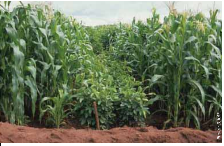
A maize plantation intercropped with nitrogen fixing trees.

Farmers also benefit from more money from fodder, fuel wood, food and building materials. In very humid areas, the land has at least 20% tree cover while the driest agricultural areas have less than 5% tree cover. Farmers should therefore plant the right trees, which not only provides food for beneficial insects like bees but also prevent erosion of valuable top soil, act as wind breakers and keep away pests.