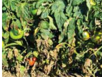
Early blight in tomatoes leaves (above) in tomato fruit (below).

Planting: Do not plant consecutively tomato crops on the same land from one season to the next. Do not rotate tomatoes with related crops such as potatoes, pepper or eggplant. Prop up the tomato plants to keep them off the soil and keep tomatoes free of weeds. For potatoes, ridging