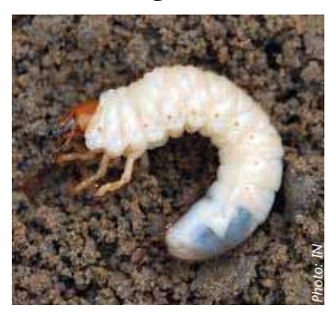
How can one control chaffer grubs in maize to stop their destruction?

Chaffer grubs are creamy-coloured pests about 1.5cm (0.6 inch) length. The pests are common in the root system of most growing plants. Chaffer beetles lay their eggs on the ground. The eggs later hatch into chaffer grubs, which dig into the soil and come out of the soil later as chaffer beetles. The chaffer grub is difficult to control using pesticides. But they are controlled naturally by nematodes. The nematodes look for chaffer grubs and attack