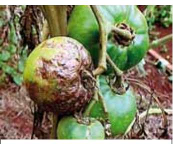
Late blight in tomatoes fruit (above) in tomato leaves (below).

Control: Use wider spacing. For tomatoes you can also prop up the plants to keep them off the soil. Add mulch to cover the soil and reduce splashes of water. Pruning will increase air movement, reduce humidity within the crop and thus reduce disease intensity. If you irrigate, do it in the heat of the day; this