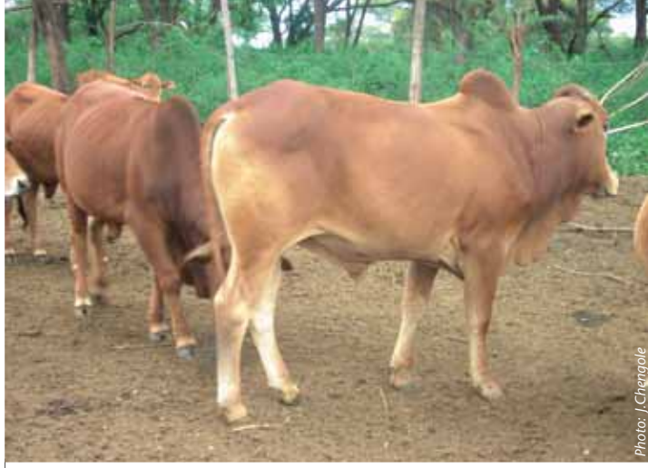
A one year old Sahiwal bull at KARI- Perkerra station, Baringo.

According to research conducted by KARI, the breed is a good milk producer - compared to other local breeds and is capable of an average of producing about 8-10kgs per day, with a fat content of 4.5 %, within an average lactation period of 10 months. Sahiwal has larger teats compared to other Zebu breeds, making milking easier. They produce small calves (average weight of 27kg) without diffi-