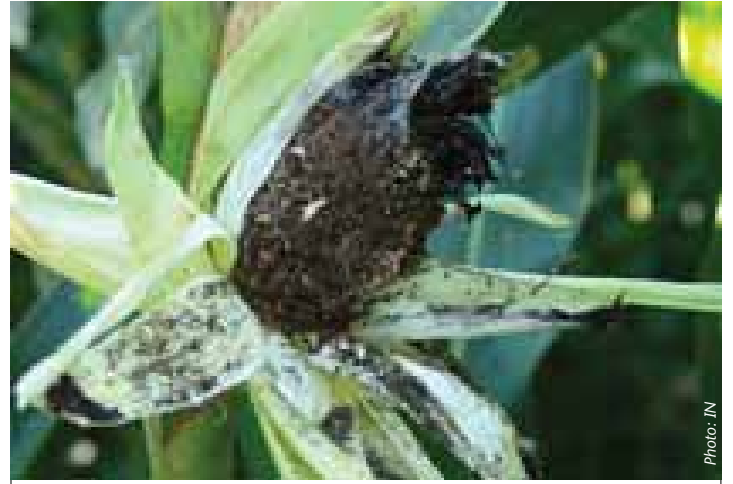
A maize cob affected by the head smut fungal disease.

The affected maize cob develops white swollen pouches, which turn black, and then burst releasing more black spores that later infect other maize plants. The affected maize becomes