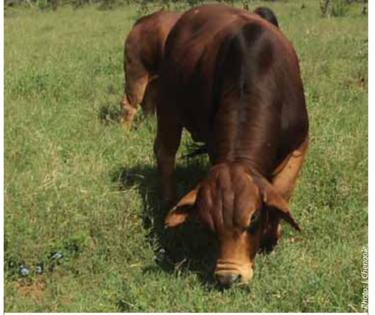
A mature sahiwal bull at the Kerio Valley Development Authority (KVDA) farm in Marigat.

Talk to the centre directors of the two stations on 0770 735 453 and 0773 479 017 respectively for more information. Farmers can get Sahiwal Semen from Kenya Animal Genetic Resources Centre (formerly CAIS). Talk to an Artificial Insemination (AI) agent or semen distributor in vour area.